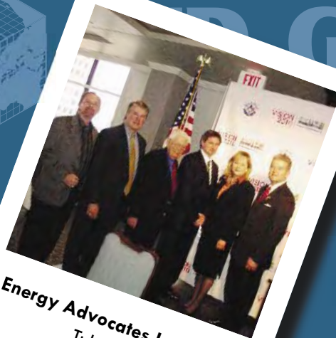
Energy Advocates Luncheon Tulsa, OK 3-9-06