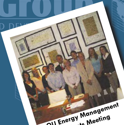
OU Energy Management Students Meeting Houston, TX 6-6-06