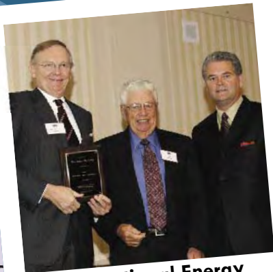
International Energy Policy Conference Dallas, TX 9-18-06