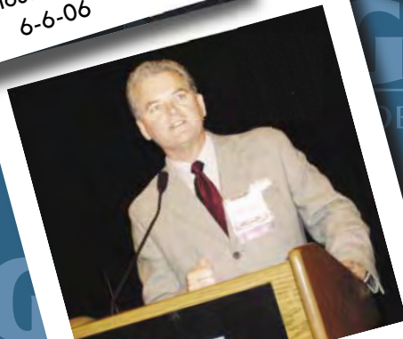
Rocky Mountain Natural Gas Conference Denver, CO 8-9-06