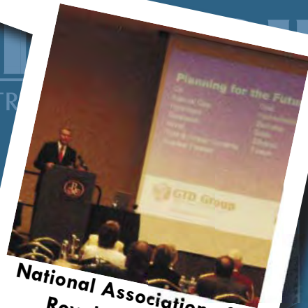
National Association of Royalty Owners Tulsa, OK; Dallas, TX 4-6-06; 9-8-06